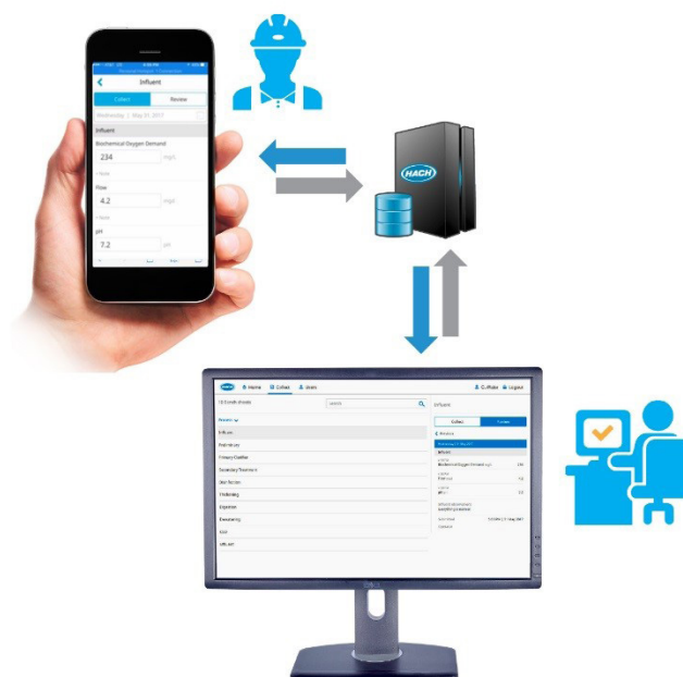
Figure 4: Accurate field data collection, available to authorized users, anytime, anywhere, on any device.