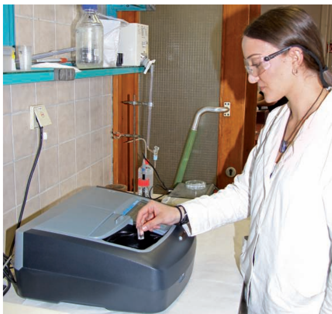
Figure 3: Sample insertion using a cell