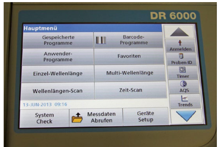
Touch screen with clearly structured user interface

It is not only the barcode detection of round cells that enables faster sample processing, but also the RFID module. This technology not only makes it possible to identify the user using a RFID user transponder on the device; RFID transponders can also be used to identify the samples. This firstly rules out sample mix-ups and secondly facilitates or ensures traceability. The table on page 2 shows the technical data for the photometer.